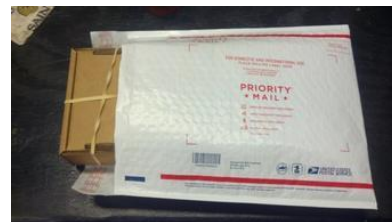
This is: Flat Rate Bubble Bag, $8.00 to ship anywhere. Size: 12.5 X 9.5" Holds 20#, Great for full blade box.

-----CUT OFF THIS LABEL AND TAPE IT YOUR BOX-----