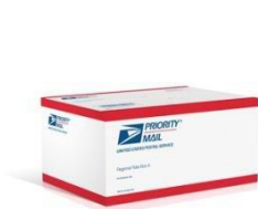
Regional Boxes Postage is very cheap

**DO NOT USE A SMALL FLAT RATE BOX, IT WILL BURST OPEN IF DROPPED OR THROWN BECAUSE THE CARDBOARD IS VERY THIN.**