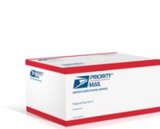
Regional Boxes Postage is very cheap

**DO NOT USE A SMALL FLAT RATE BOX, IT WILL BURST OPEN IF DROPPED OR THROWN BECAUSE THE CARDBOARD IS VERY THIN.**