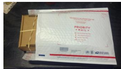
This is: Flat Rate Bubble Bag, $8.00 to ship anywhere. Size: 12.5 X 9.5" Holds 20#, Great for full blade box.

-----CUT OFF THIS LABEL AND TAPE IT YOUR BOX-----