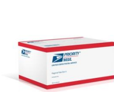
Regional Boxes Postage is very cheap

**DO NOT USE A SMALL FLAT RATE BOX, IT WILL BURST OPEN IF DROPPED OR THROWN BECAUSE THE CARDBOARD IS VERY THIN.**