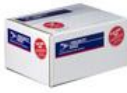
This is: Flat Rate Boxes Size: Medium and Large